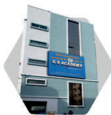
COIMBATORE RS PURAM