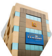
CHENNAI ARYA GOWDA ROAD WEST MAMBALAM